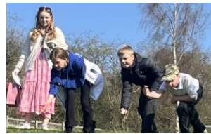
Egg rolling fun for all!